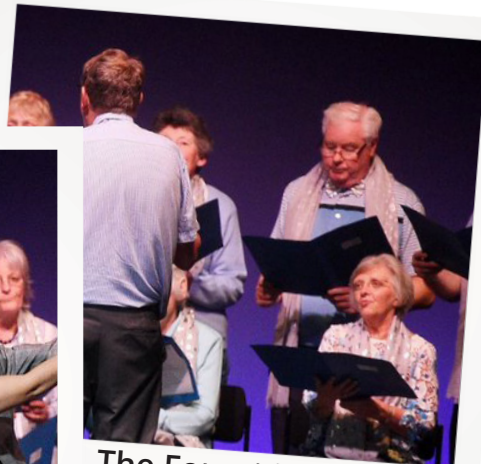
The Forget Me Notes choir at 25 LIVE