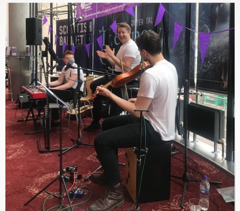
Capital Theatres' house band (The Lafayettes)