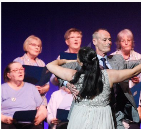
The Forget Me Notes choir performing at 25 LIVE