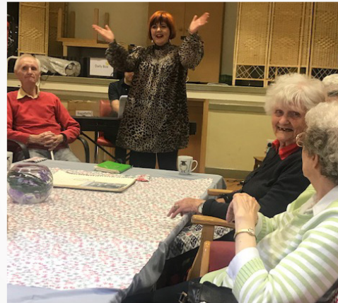
The Hillman Hunter - see review on page 6