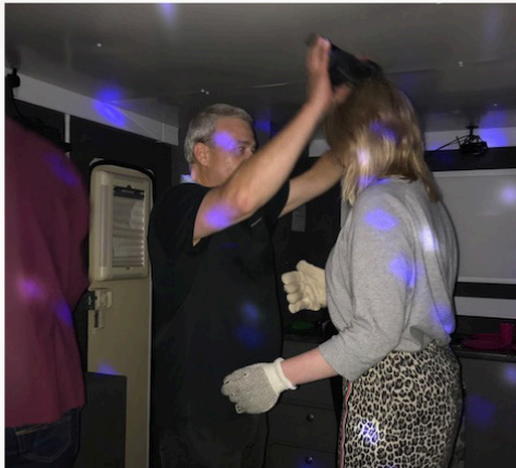
Staff Dementia Awareness Training

Life gives you plenty of time to do whatever you want to do, if you stay In the present moment – Deepak Chopra