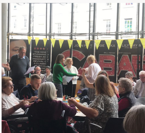
BBC Music Day Tea Party